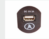
USB Type Mobile Charger