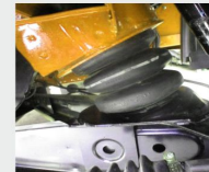
Strong Rear Suspension