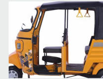
Ergonomically Designed and Modified Seat Cover