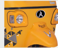
Clear Lens Multi Focal Head Lamp with Halogen Bulb