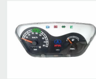
Mono Unit Cluster