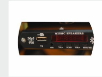
FM Radio System