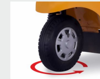
2.5mm Low Turning Radius