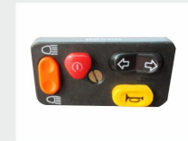
Push Button Electric Start