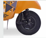
Strong Front Suspension with Bigger Swing ARM