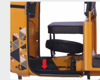
Emergency Hand Start