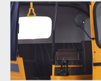
Spacious Luggage Compartment